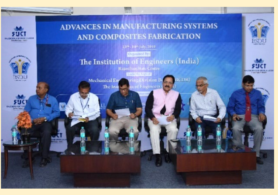
National Seminar on Advances in Manufacturing System and Composite Fabrication