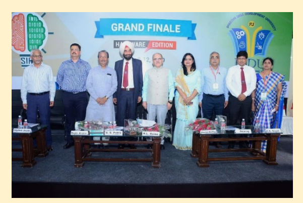
Smart India Hackathon