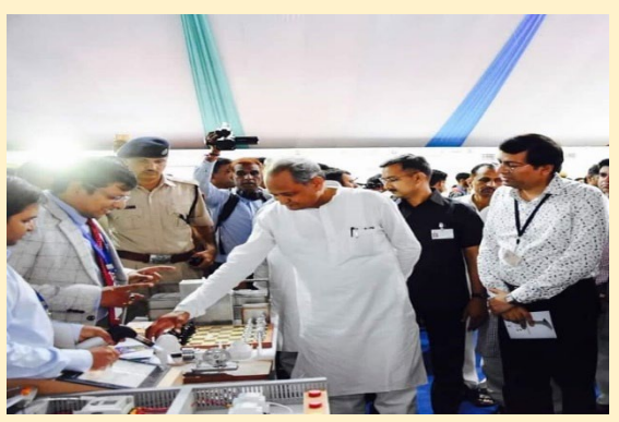
Participation in Innovation Expo at Birla Auditorium from on 18 - 20 August 2019