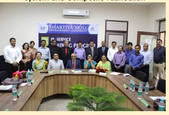
In-Service Training Program for IAS and CSS Officers