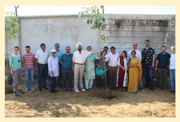
Tree Plantation Drive