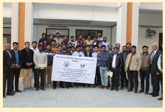
7 Day Training of Assessors Program on Power Distribution Job Roles