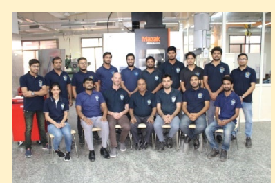
Team Manufacturing Skills