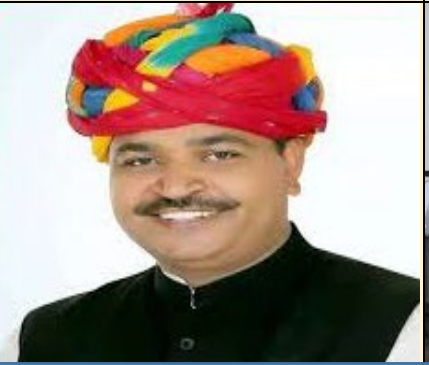
Shri Tika Ram July, Hon'ble Labour Minister visited BSDU on 07 Jan. 2020 & inaugurated Beauty & Wellness Centre