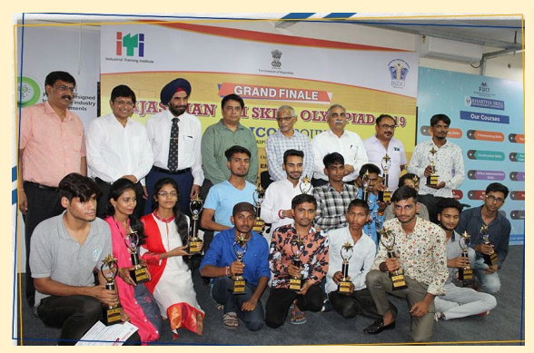
Rajasthan ITI Skill Development Olympiad 2019